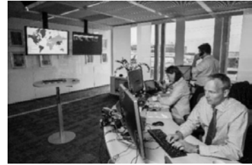
Medical and security assistance plateau.