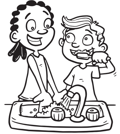
W _____ h _____ and b _____ t _____