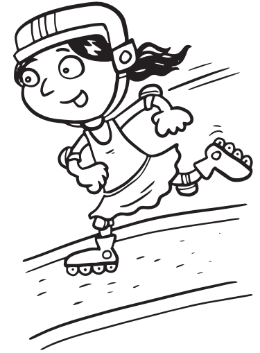
Have f _____

Answers: Exercise regularly, wash hands and brush teeth, eat healthy food, have fun