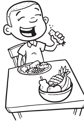
Eat h _____ food