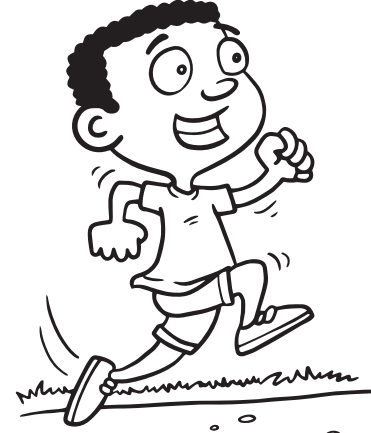
E _____ regularly