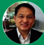
Shanghai Association of Foreign Investment