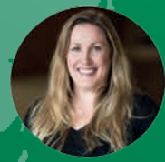
The University of British Columbia