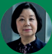
Asia Infrastructure Investment Bank (AIIB)