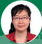
GE Renewable Energy