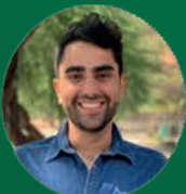
Project Everest Ventures