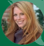
Lawyers Without Borders