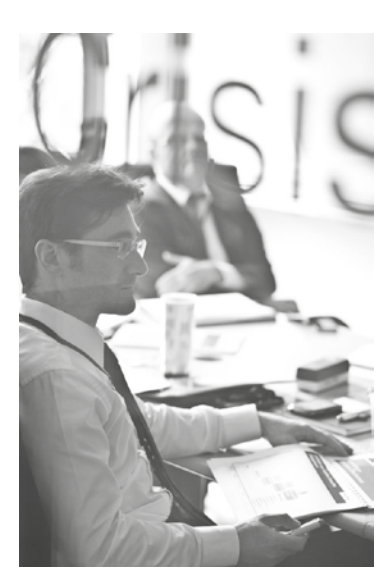
To implement a crisis cell, even reduced to an on-duty assistance around a dedicated phone line, is an essential element of security at all levels.