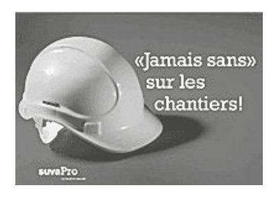
The Swiss and local safety rules are to be followed. If these differ abroad, the most protective one for the collaborator must be followed.